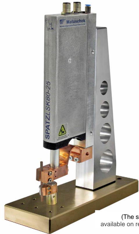
(The stand is available on request)